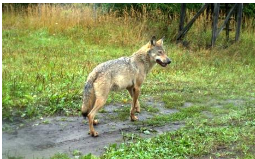
Figure 1: A wolf spotted in Brandenburg.