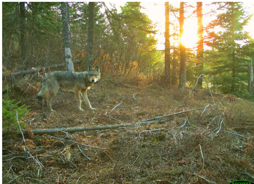
Figure 2: A Minnesotan wolf at Voyageurs National Park. From the Voyageurs Wolf Project website.

https://www.voyageurswolfproject.org/photos?lightbox=dataIte .